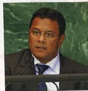
Marcus Stephen, the President of Nauru, addressing the U.N. last year

Why is the president of the tiny Pacific island nation of Nauru so concerned about climate change?